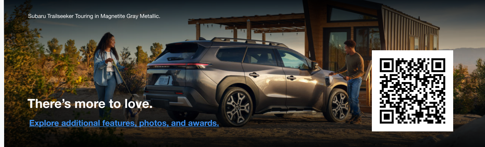
Subaru Trailseeker Touring in Magnetite Gray Metallic.

Featuring standard dual motors that deliver 375 horsepower and legendary Subaru Symmetrical All-Wheel Drive, the all-new 2026 Trailseeker takes electric to exhilarating new heights. Rugged and capable, the Trailseeker is a go-anywhere electric SUV with 8.5 inches of ground clearance and standard dual-function X-MODE® to help you over almost any obstacle on just about any terrain and trail condition.